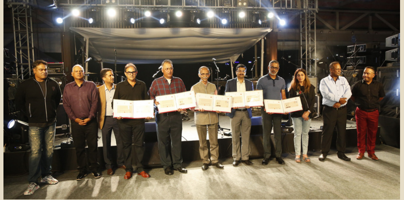
Golden Jubilee Celebrations & Logo Launch