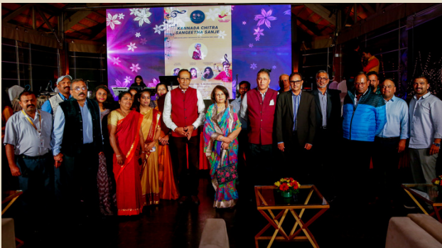
Karnataka Rajyotsava Celebrations