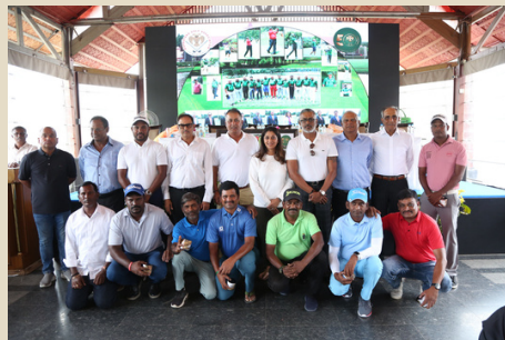
Caddies Day Tournament