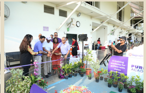
Purple Academy Tournament