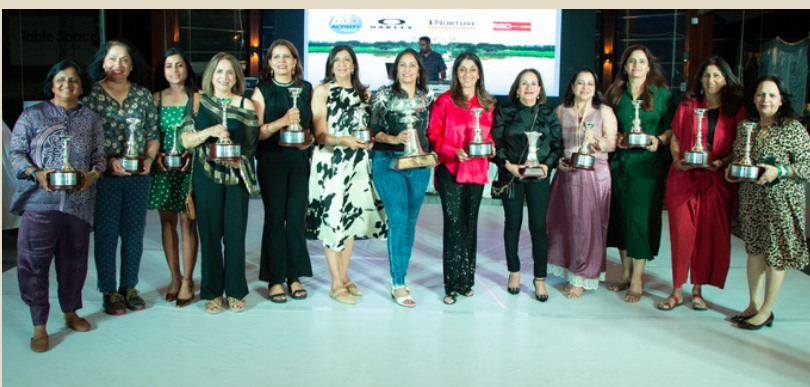
Ladies' Amateur Tournament