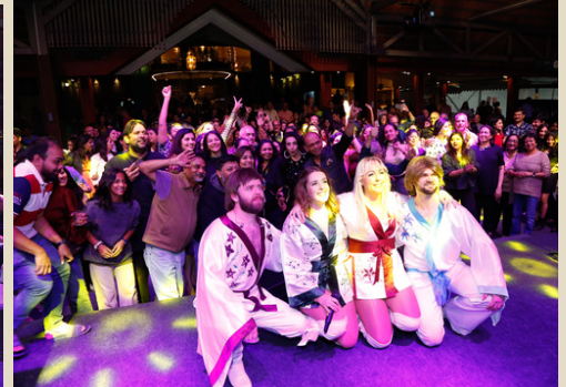
ABBA Music Event