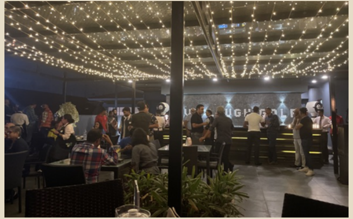
CLARET JUG BAR OPENING