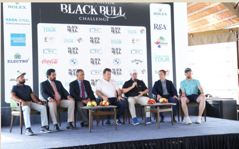
Duncan Taylor Black Bull Tournament